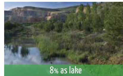
8% as lake