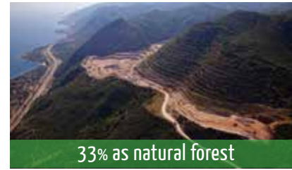
33% as natural forest

Thermal mass: A property unique to heavyweight materials such as concrete, which can soak up and store heat or cold. This reduces heating and cooling costs in buildings, lowers energy consumption, especially at times of peak power demand, and decreases CO 2 emissions.