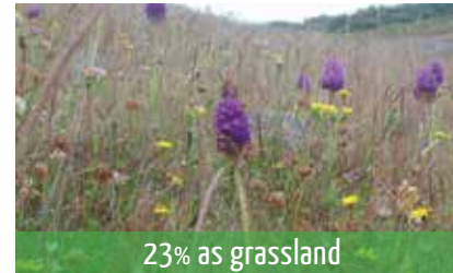
23% as grassland